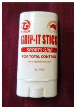
Grip-it-stick (organic grip) $18.00