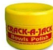
Crack-a-Jack (bowls polish and grip) $8.00