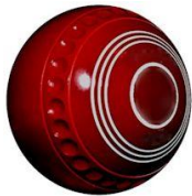
Used club bowls are occasionally available for sale.

New bowls can be purchased from Shelley Sidel, Taylor Bowls agent for Vancouver Island