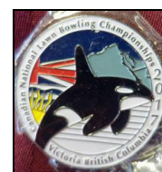
Pins Club, Bowls BC and 2017 National Championships $5.00