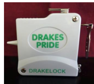
Tape measures (various) $35.00 to $50.00