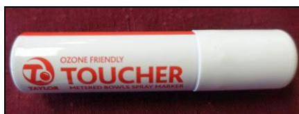
Toucher spray chalk $10.00