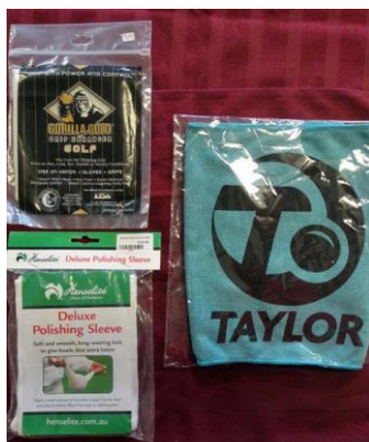
Bowl buffing cloths (various) $10 to $20