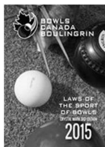
Laws of the Sport of Bowls, Crystal Mark, 3rd Edition, 2015 $8.00