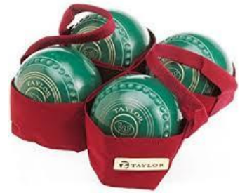
Lawn bowls carry slings $22.00