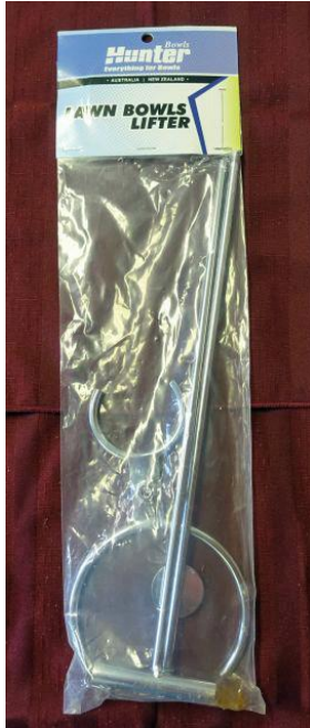
Bowl lifter $35.00