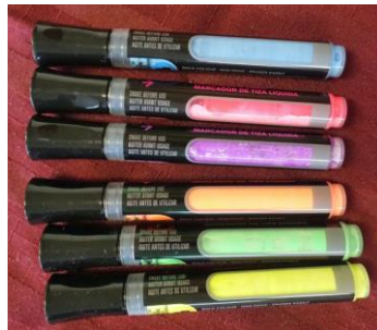
Chalk markers (various colours) $3.00

New bowls can be purchased from Shelley Sidel, Taylor Bowls agent for Vancouver Island